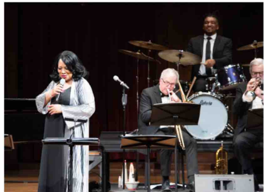
"Our Huckleberry Friend: The Lyrics of Johnny Mercer," CJO/TMTP 2023